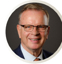
HON. BRUCE RALSTON Minister of Forests @BruceRalston